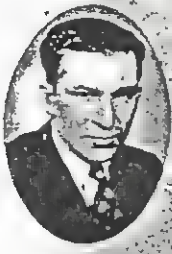
Heine Granger Dairy Products Retail